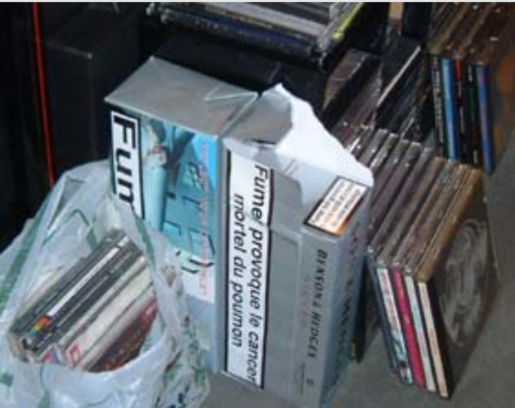
Cartons of cigarettes stacked beside music CDs

Reduction Positioning Qualitative, April 2004—UK—CSR International Healthcare Exploratory Qualitative, December 2002—UK—The Big Picture Reduction/TA Strategic Qualitative, January 2004-UK, Ireland, France, Sweden, Australia-Flamingo Empathic/Ethnographic, February 2004-UK, France, Germany, Sweden, Spain-IDEO NPD Qualitative, April 2004-UK, Sweden, Canada, Japan-Flamingo Package Test, January 2004-UK, Australia-PRS NPD Qualitative, June, 2003-UK, US-Forbes Consulting Group Positioning Qualitative Research, July 2000-US-Liebling Associates